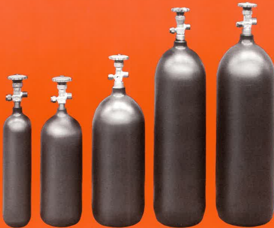
2½ lb. 5 lb. 10 lb. 15 lb. 20 lb.